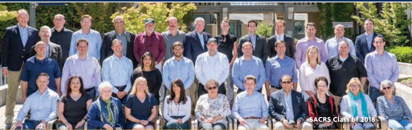
SACRS Class of 2018